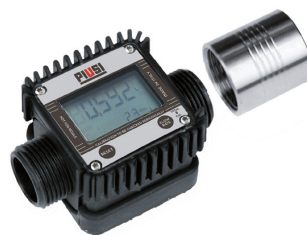
K24 plastic version