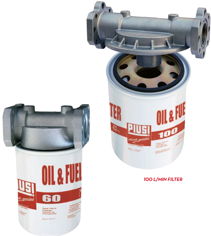
60 L/MIN FILTER