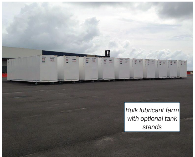
Bulk lubricant farm with optional tank stands

Disclaimer: Information and photographs shown are for marketing purposes only. Actual product may vary to images shown due to continual improvement processes, design changes and optional extras