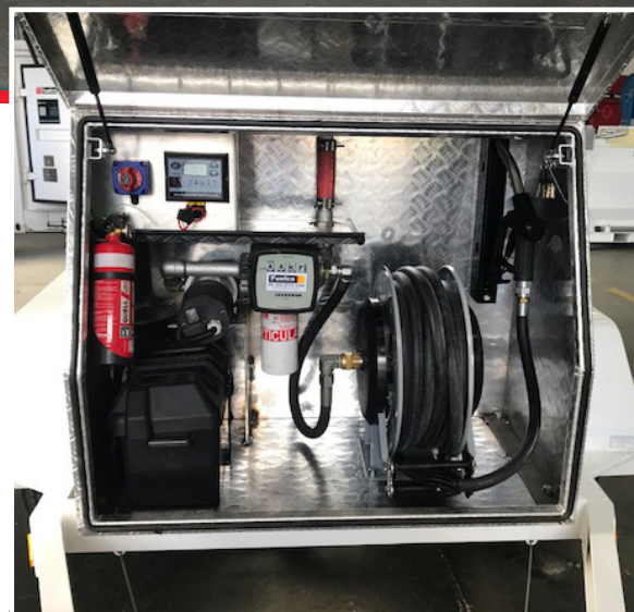
Bunded Pump with fittings