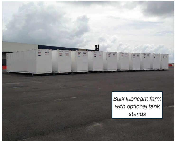
Bulk lubricant farm with optional tank stands

Disclaimer: Information and photographs shown are for marketing purposes only. Actual product may vary to images shown due to continual improvement processes, design changes and optional extras