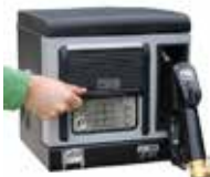
FUEL DISPENSERS (Fuelco, PIUSI)