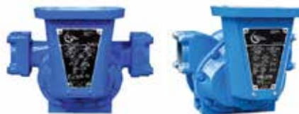
FLOW METERS (Fuelco, TCS)