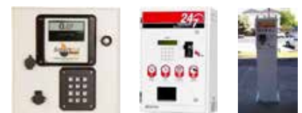
FUEL MANAGEMENT SYSTEMS