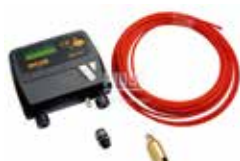
FLUID MONITORS (Fuelco, PIUSI)