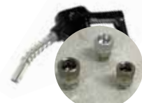
NOZZLES & SWIVELS