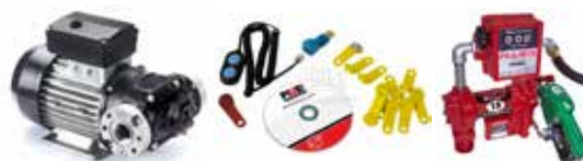
PUMPS & KITS (Fuelco, PIUSI, FILLRITE)